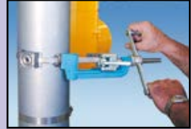
C00189 BAND-IT® Tool