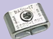
Stainless Steel Scru-Lokt Buckle