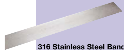
316 Stainless Steel Band