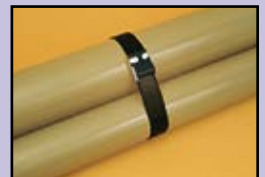
316 Coated Stainless Steel Band