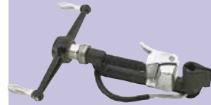
C00369 BAND-IT® Heavy Duty Tool

*BAND-IT reserves the right to substitute material with equal or better corrosion resistance and/or mechanical specifications.