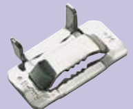
316 Stainless Steel Ear-Lokt Buckle