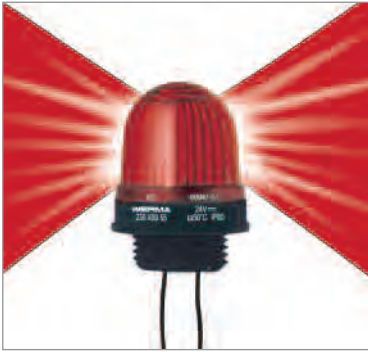
Mainly sideways illumination