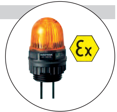
The LED Installation Beacon 231 is also available in Ex version (see page 253)