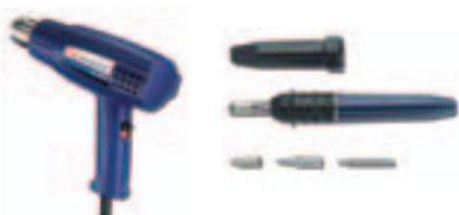
Heat guns and related accessories, see pages 119-121.